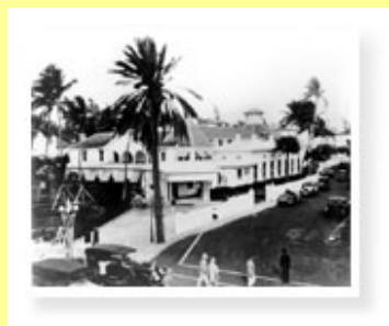
Bradley's Palm Beach "Beach Club"—the longest-running illegal gambling casino in America's history. Ed Bradley, the "greatest gambler" in America, and Jesse Livermore, the "greatest stock speculator" in America, were fast friends.