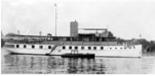
The original Anita Venetian with a 40-foot launch tied along side. Livermore loved yachting. In all there were 3 Anita Venetians —the last one was 300-foot long.