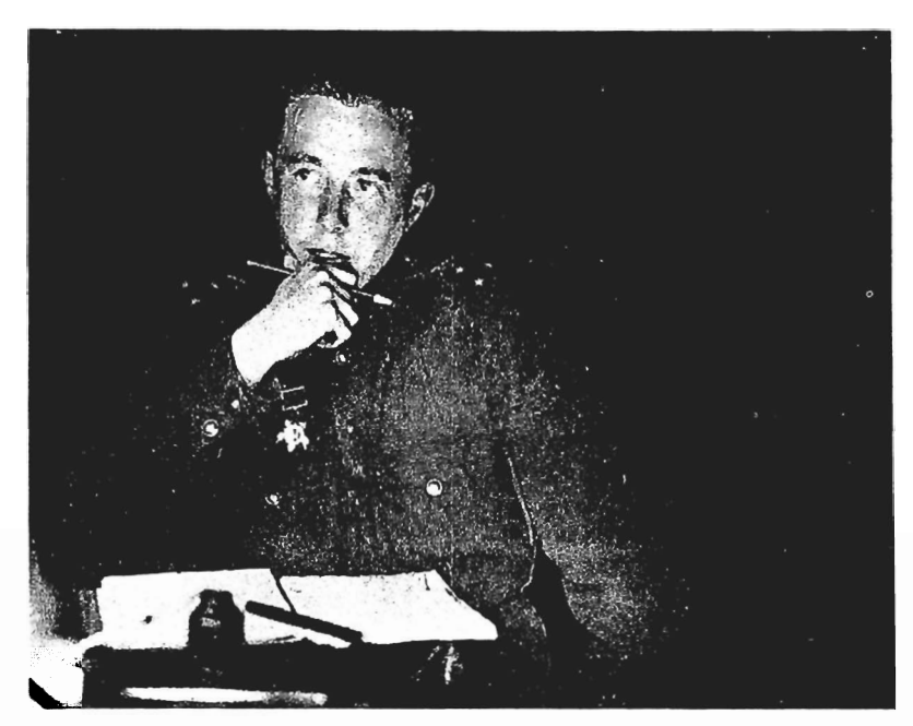
Aleksandr Isayevich Solzhenitsyn—in the army