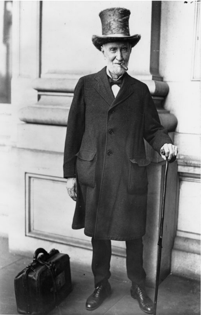
1. Joseph G. Cannon, the powerful Speaker of the House from 1903 to 1911.