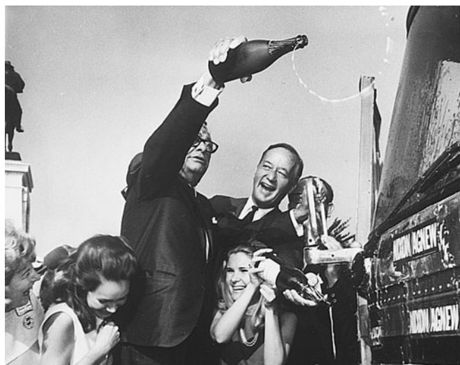
3. Campaigning can be joyous as well as arduous. Here Senate minority leader Everett M. Dirksen (R-Illinois) and Charles Mathias (R-Maryland) christen a campaign bus at the Capitol in 1968.

restriction on free speech, while proponents argued that unlimited individual spending favored the independently wealthy. Money talks, and those with more can talk more loudly.