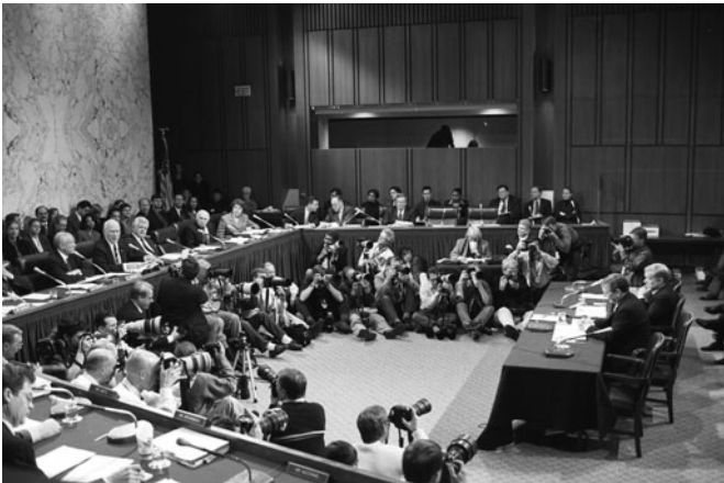
10. Reflecting public interest in the event, press photographers crouched between the senators and the witness during the Senate Judiciary Committee’s hearings on the 2001 nomination of former senator John Ashcroft (R-Missouri) to become attorney general.

To avoid embarrassing rejections, presidents began consulting senators before submitting nominations for confirmation, which sometimes meant passing over their preferred choice for a candidate more likely to win confirmation. As a framer of the Constitution, James Madison regarded the choice of nominees to be an executive function, but as president he dropped his preferred secretary of state for a candidate the Senate wanted. Presidents who tangled with the Senate, such as John Tyler and