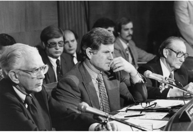
5. Senator Edward M. Kennedy (D-Massachusetts) chairs a hearing of the Senate Judiciary Committee. He is flanked by Senators Howard Metzenbaum (D-Ohio) and Strom Thurmond (R-South Carolina).

Members of these committees may be little known outside of their home states and may devote themselves to legislative work rather than seek the national spotlight, trying to accomplish much with a minimum of disruption. Some committees are more polarized, notably the Judiciary Committee, when both parties appoint reliable ideological warriors who battle over the courts, constitutional amendments, and civil liberties. Senators once voted for qualified judicial nominations regardless of ideology, out of deference to the president, but over time the confirmation process developed into a battle of wills between presidents and the Senate, as the federal judiciary took a more active role in policy making by interpreting the laws beyond what some members of Congress believed they had intended.