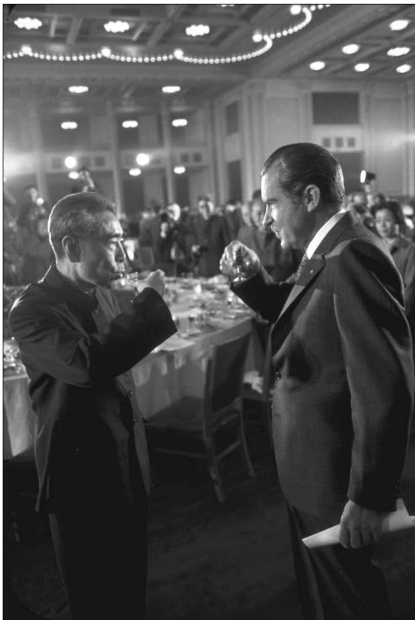
Zhou Enlai and Richard Nixon sharing a toast at a banquet in the Great Hall, 1972.