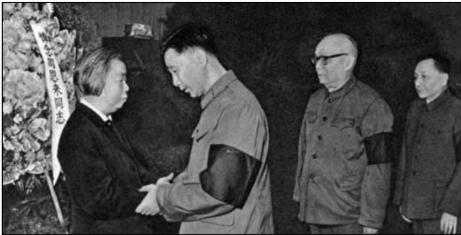
Deng Yingchao, widow of Zhou Enlai, is offered consolation at a memorial service after Zhou Enlai's death. Party and state leaders pictured include Wang Hongwen, Ye Jianying and Deng Xiaoping.