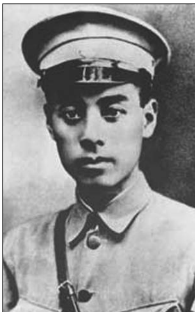
In 1924, Zhou was appointed director of the Political Department of Whampoa Military Academy in Guangdong Province.