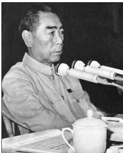
Zhou Enlai at the Second Plenary Session of the Ninth Central Committee of the Chinese Communist Party, August 1970.