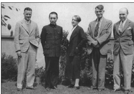
Zhou Enlai (second from left) in 1938 in Wuhan with Western friends. (The American writer Agnes Smedley is in the middle).