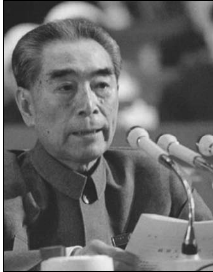
January 1975, Zhou delivered his last, legendary speech at the Fourth National People's Congress, in which he reaffirmed the "Four Modernizations".