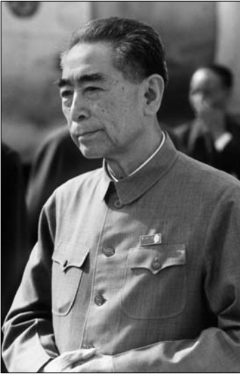
Zhou Enlai waits at Beijing airport for the arrival of the French President G. Pompidou in September 1973.