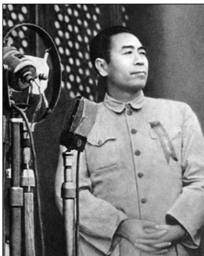
Zhou Enlai at the grand ceremony in celebration of the founding of the People's Republic of China on the Tiananmen rostrum, October 1, 1949.