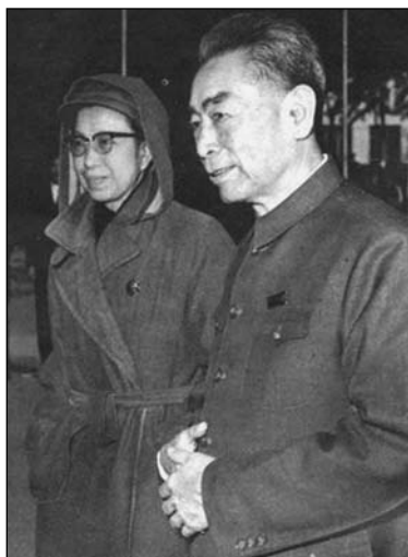
Zhou Enlai with Jiang Qing during the Cultural Revolution.