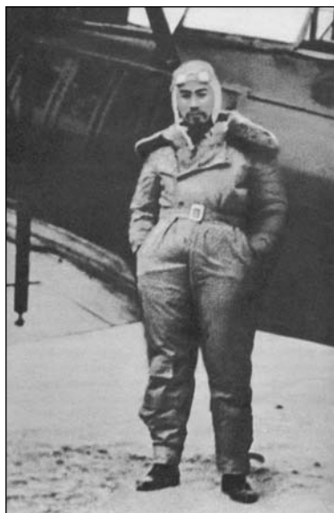
Zhou Enlai in flying gear in front of an airplane after returning from Xi'an, date uncertain.