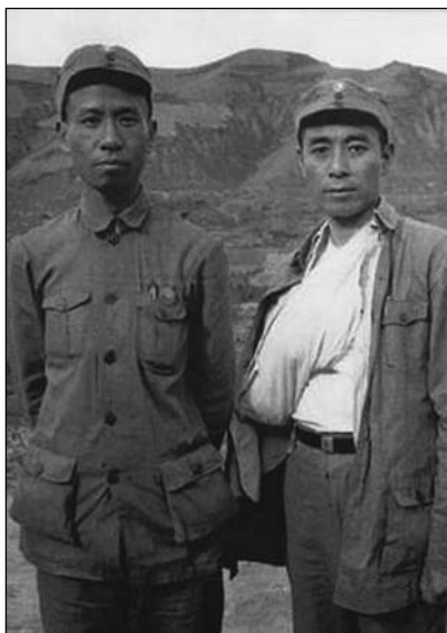
In July 1939, Zhou Enlai fell off a horse in Yan'an and permanently injured his right arm. He is pictured here with Liu Shaoqi.