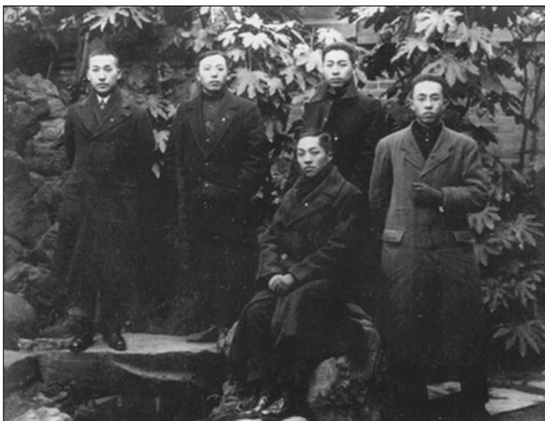
Zhou Enlai in Japan with fellow Chinese students in 1917. Zhou is on the far right (standing).