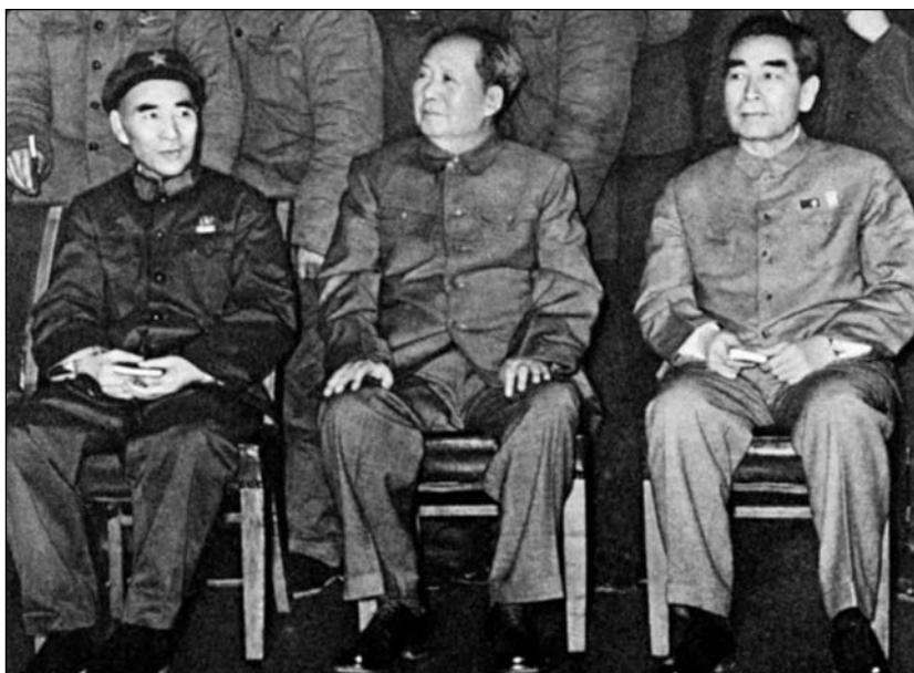
Mao Zedong with Vice Chairman Lin Biao and Zhou Enlai, January 26, 1968.